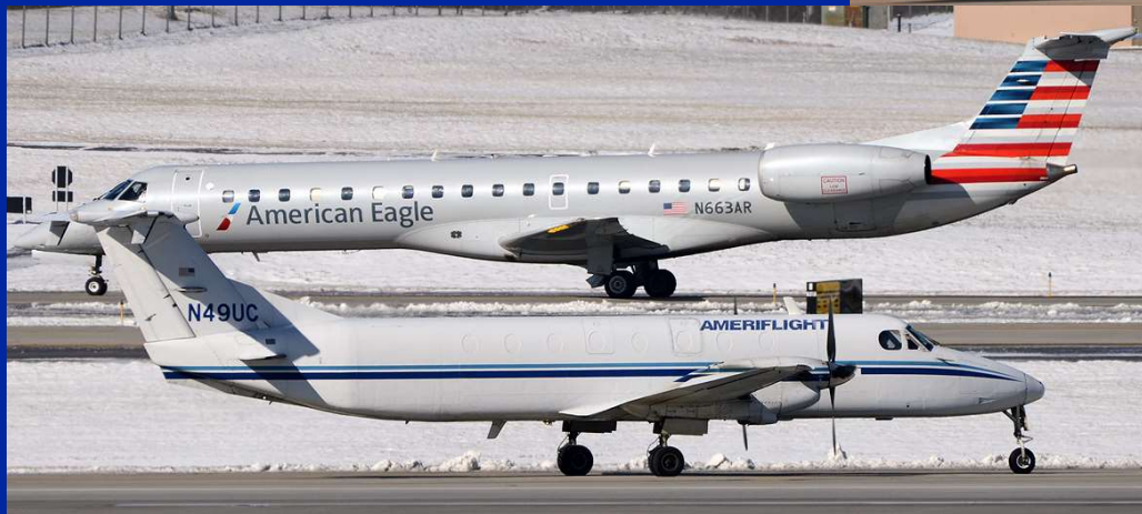
Beech 1900 & ERJ-145