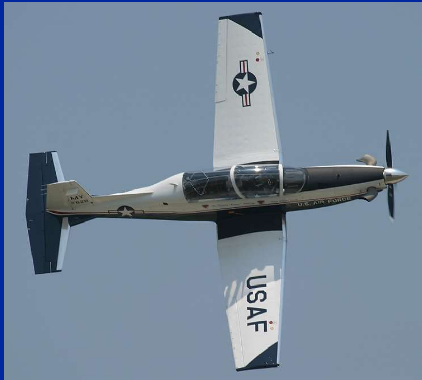
T-6A Texan II