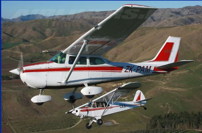
Cessna 172 & Piper Cub ↑ Piper Warrior ↓