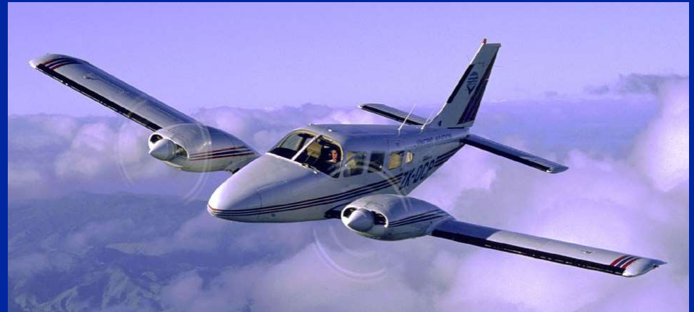
Piper Seneca ↑ Cessna 310 ↓