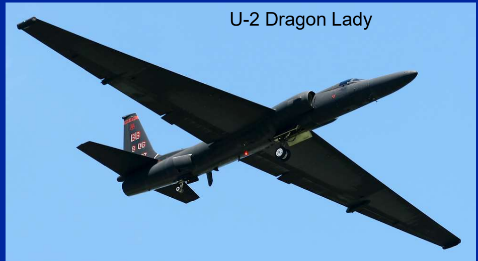
U-2 Dragon Lady