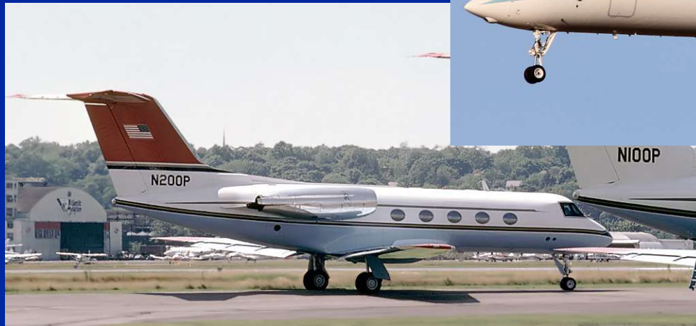
Gulfstream II (late 1970's)