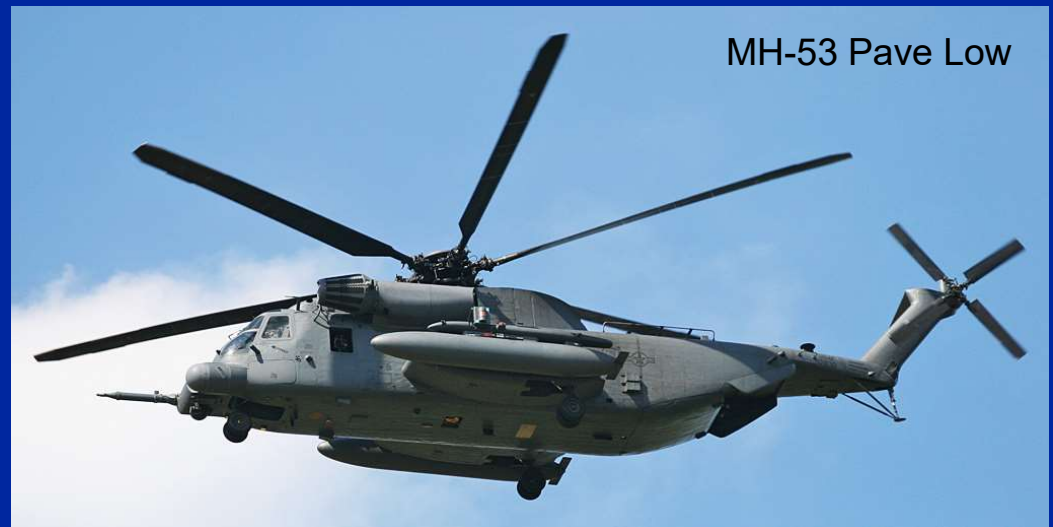
MH-53 Pave Low