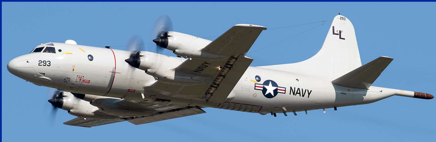
Lockheed P-3C Orion