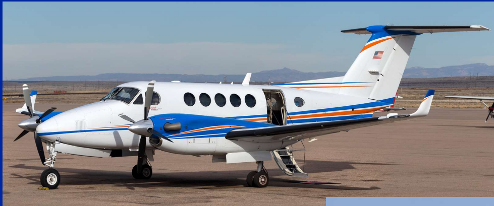
Beechcraft Super King Air 200