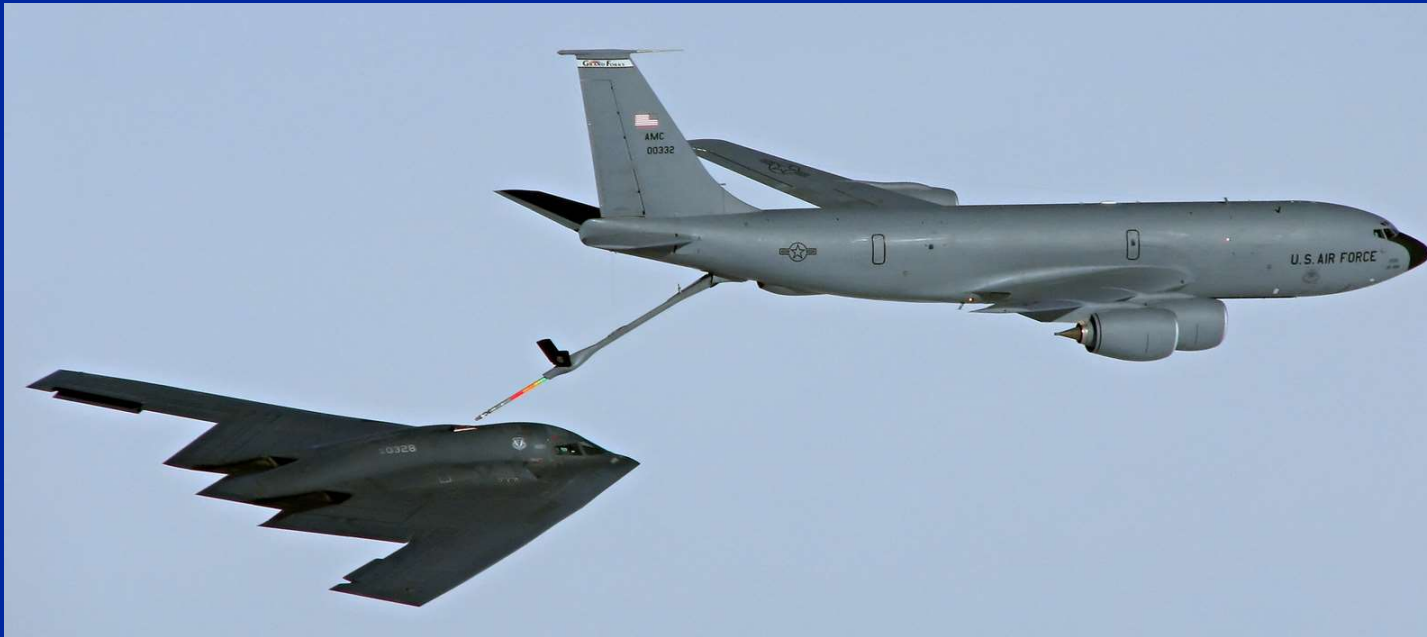
B-2 & KC-135